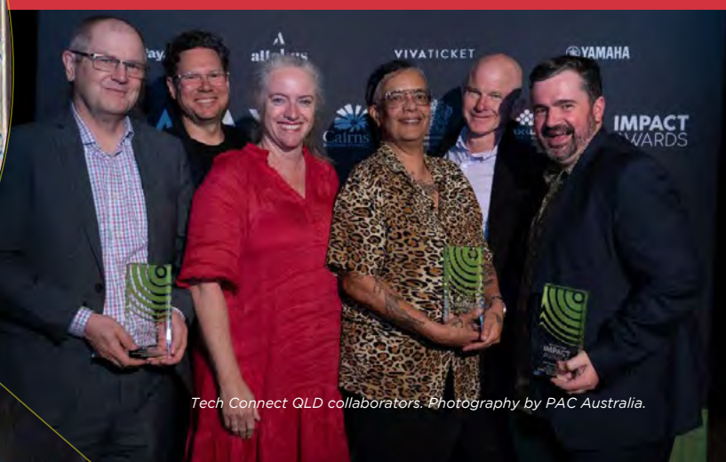
Tech Connect QLD collaborators.

Tech Connect QLD, was recognised for its collaborative nature and influence that ensures the sustainability and rigour of technical skills development for the industry. A collaboration between Arts Centre Melbourne, QPAC and Stage Queensland, Tech Connect QLD is funded by Vincent Fairfax Family Foundation.