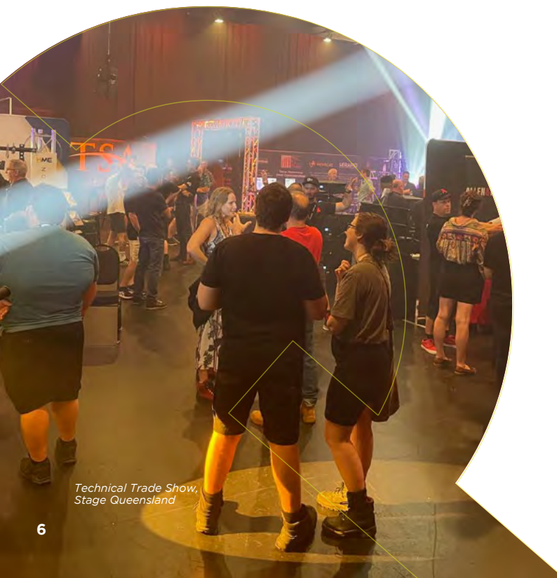
Technical Trade Show, Stage Queensland