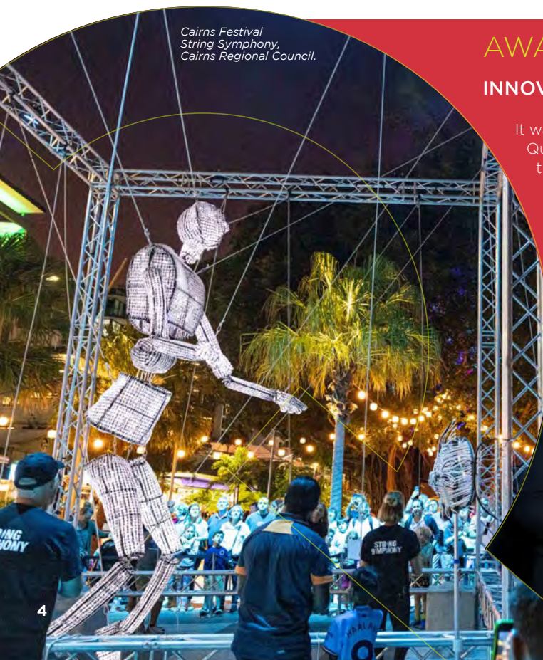
Cairns Festival String Symphony, Cairns Regional Council.