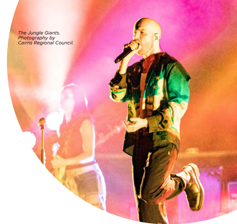
The Jungle Giants.

The statewide touring service is an initiative of the Queensland Government through Arts Queensland