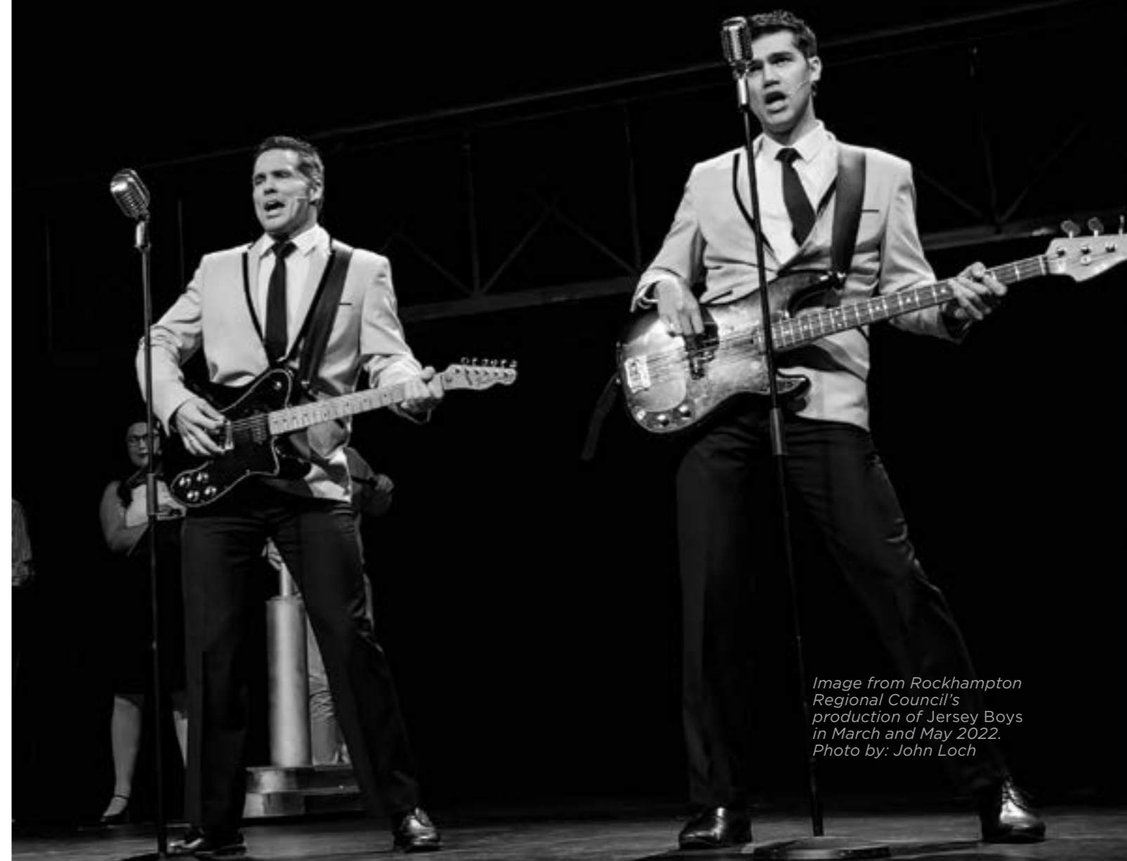
Image from Rockhampton Regional Council's production of Jersey Boys in March and May 2022.

Number of Local Government Areas represented by Stage Queensland members