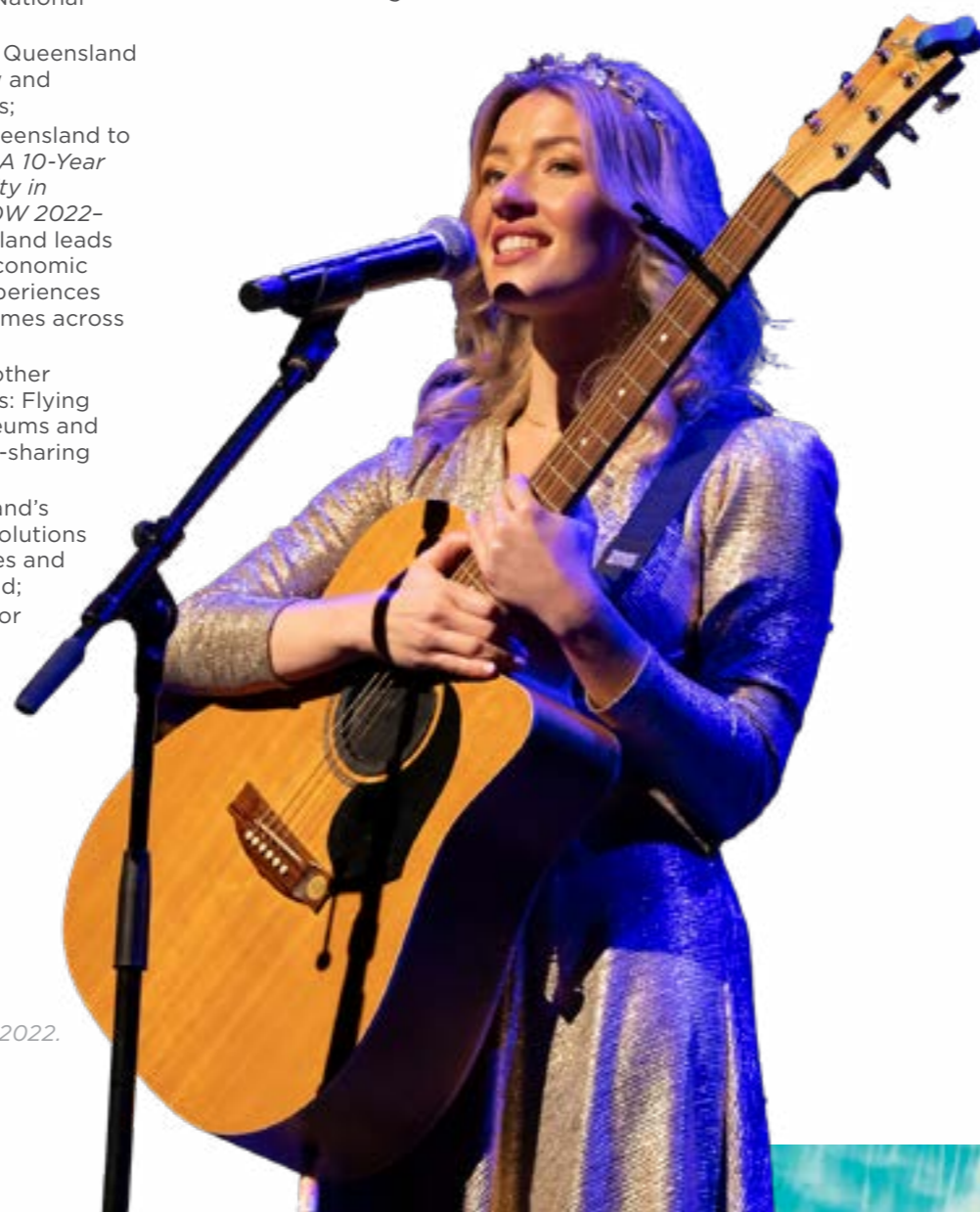
Image from "Golden", Taken at Logan Entertainment Centre, 2022.