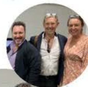
Management Committee, Strategic Planning

Over the next four years we will optimise our services, concentrating on increasing the sector's capacity and capability. Through collaboration with our industry partners, we will galvanise a unified voice for advocacy and work together to create new opportunities and innovative pathways to the future.