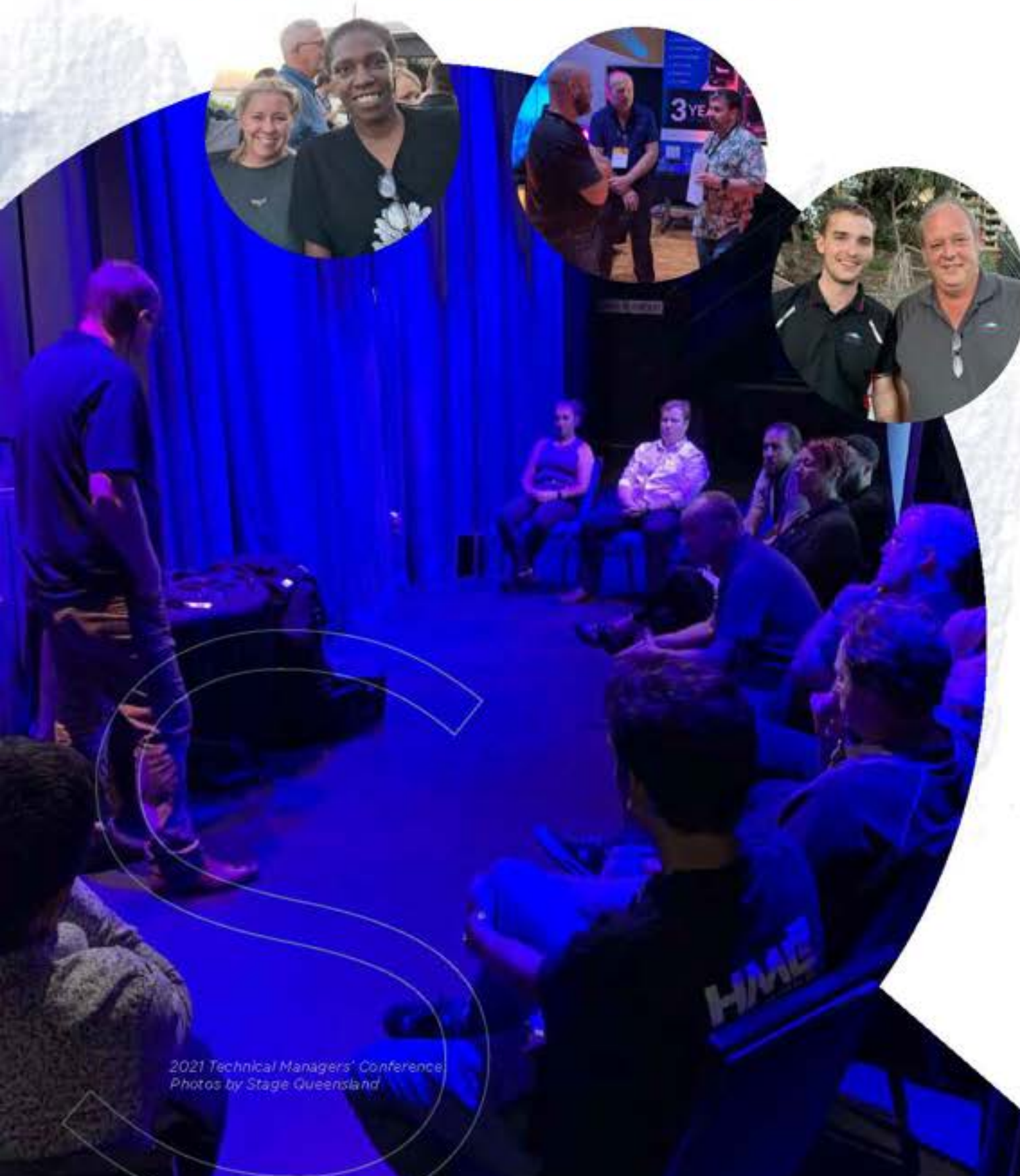
2021 Technical Managers' Conference

21 TO 23 FEBRUARY, THE EVENTS CENTRE, CALOUNDRA