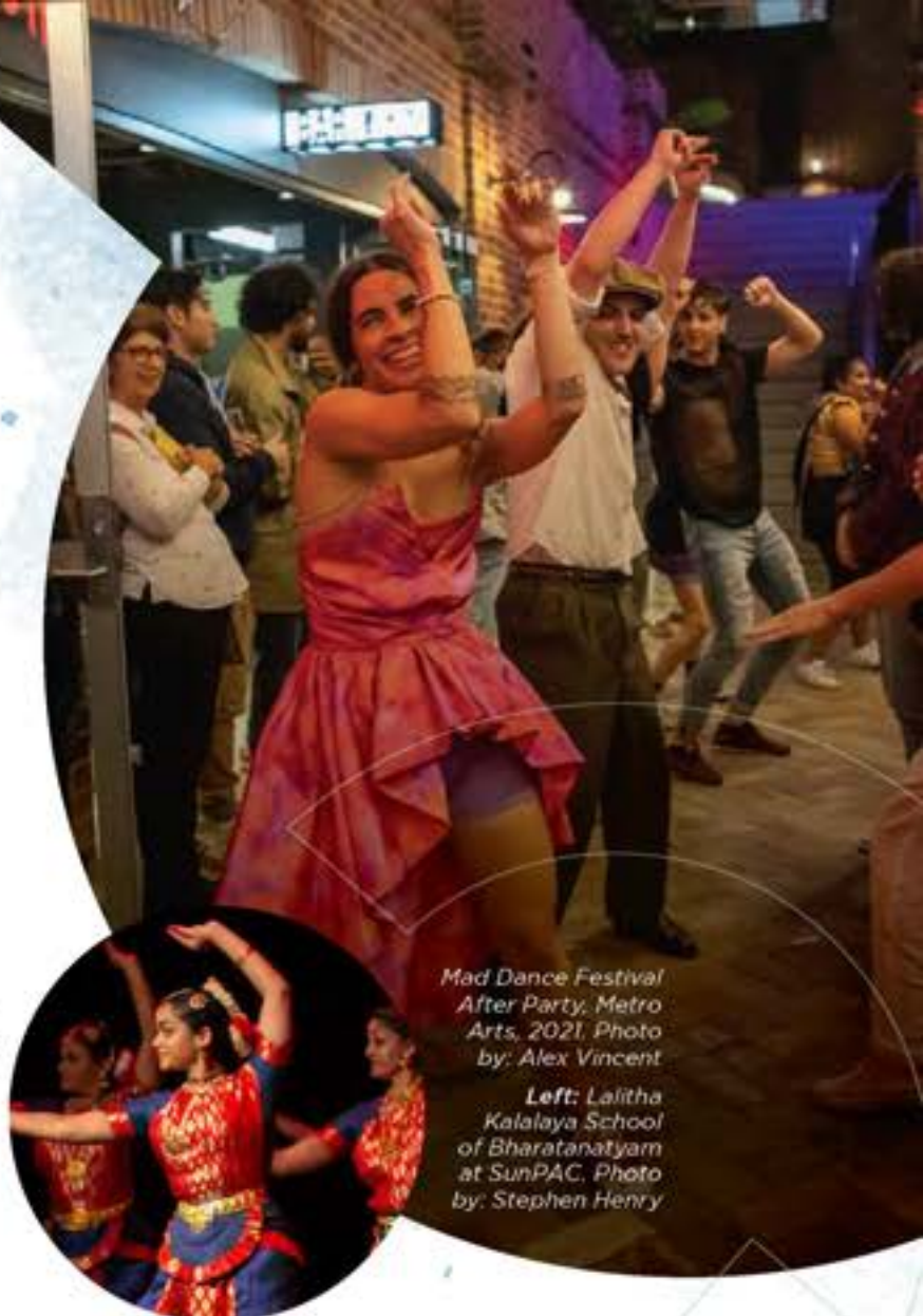
Mad Dance Festival After Party, Metro Arts, 2021.