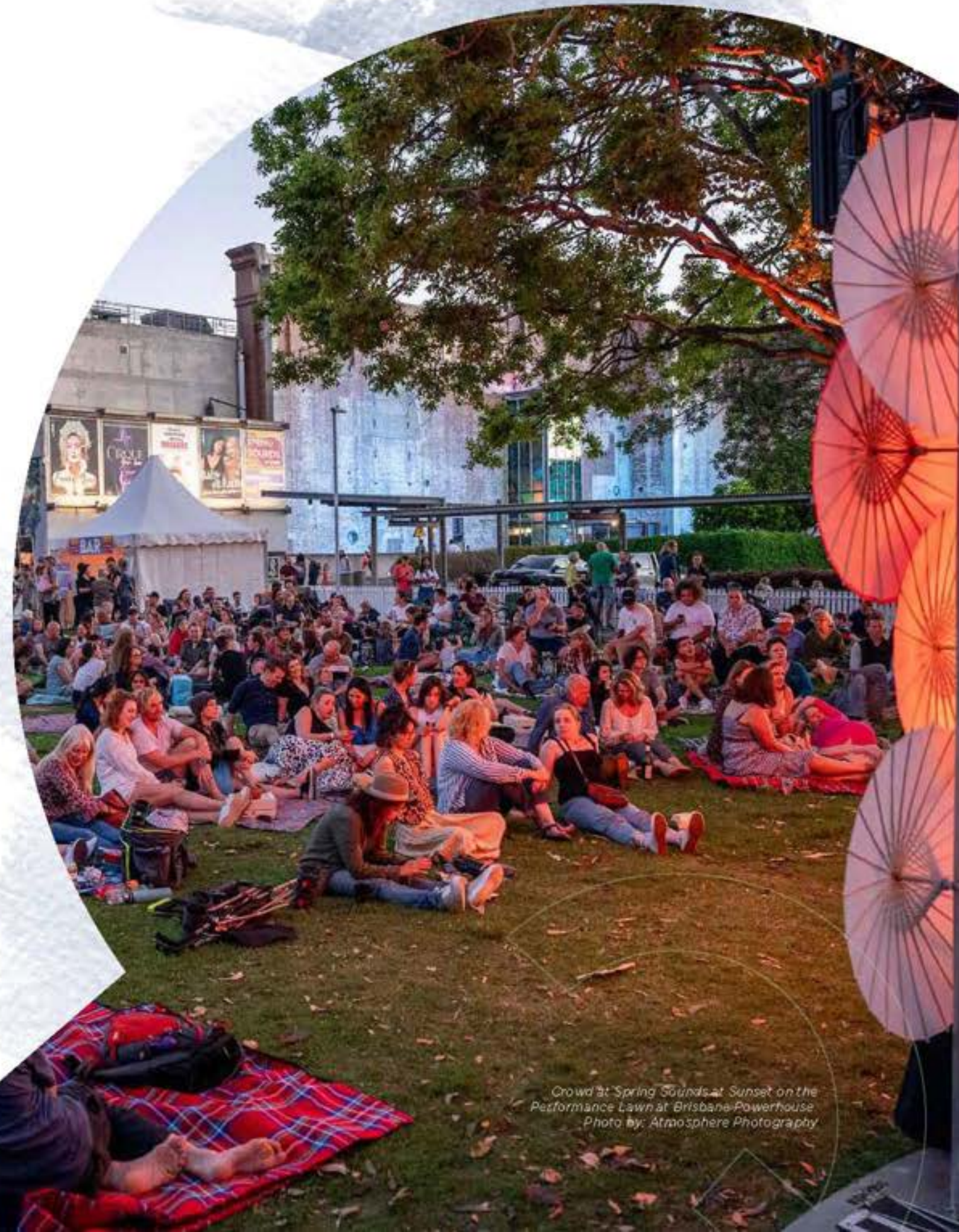
Crowd at 'Spring Sounds at Sunset' on the Performance Lawn at Brisbane Powerhouse